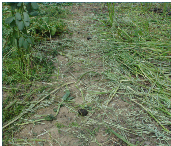
Sheep manure in a cover cropped walnut alley. This farmer stopped grazing sheep in their walnut orchard due to the potential risk (and liability) of contamination by pathogens from undecomposed manure contacting walnuts during harvest.