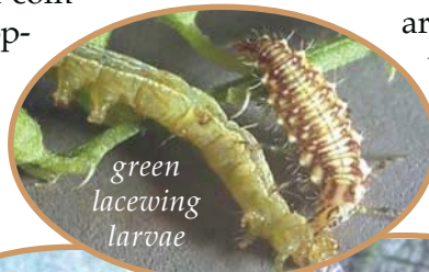
green lacewing larvae

Cutworms are a problem in seedling establishment in some alfalfa-growing areas but rarely a problem on established stands. Species are represented by the variegated cutworm, Peridroma saucia ; black cutworm, Agrotis ipsilon ; granulate cutworm, Feltia subterranea ; army cutworm, Euxoa auxiliaris ; and the Clover cutworm, Scotogramma trifolii . They are active at night, feeding and chewing through the stems of the seedlings. In the day they burrow underground or under clods, avoiding detection. Problem areas are usually found near field borders and in weedier areas. Cutworms have many predators and parasites that help control their numbers. Some of these parasites and predators can be purchased or harnessed naturally through planting or conserving habitat for them.