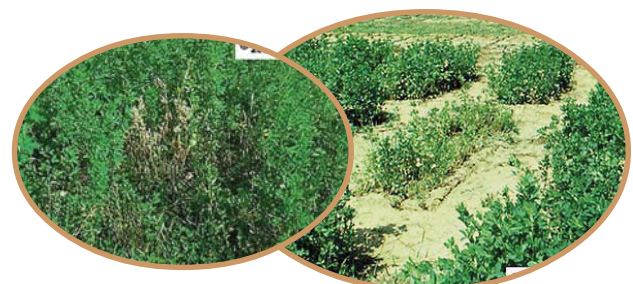
examples of alfalfa with Phytophthora root rot

Phytophthora root rot ( Phytophthora megasperma ) is a water-mold fungus that thrives in saturated, poorly drained fields. Good land preparation, careful irrigation management, and the use of resistant varieties are cultural practices that can keep this disease under control. After a hay cutting, irrigation management is critical, since older plants that have their shoots removed showed significantly more Phytophthora damaged than younger plants under the same saturated conditions (Barta and Schmitthener, 1986). Symptoms include yellowing and defoliation of older leaves, wilting, and slow growth of plants. Infected plants pull up easily, with roots and crowns breaking off due to rot. Roots may exhibit red, brown, or black lesions, but they can recover if conditions that favor this pathogen cease.