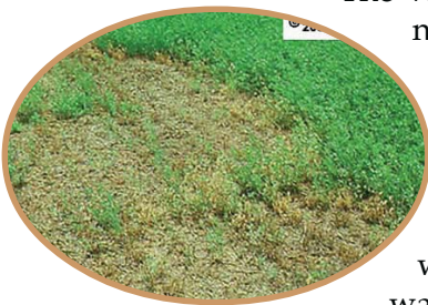
Texas root rot

The vascular system near the crown will be brown and the roots rotten. The infected area in an alfalfa field will grow outwards as the disease spreads, forming a ring pattern. After humid and rainy weather, tan spore mats 8 to 12 inches in diameter may form on the soil near the edge of these ring patterns. Extended rotation with corn, sorghum, or other grains may reduce the severity of the disease.