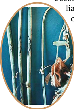
examples of plants with anthracnose

Bacterial Wilt ( Corynebacterium insidiosum ). Plants infected with this bacterium exhibit yellowish, stunted leaves and shorter stems than