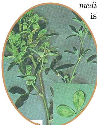
example of downy mildew

Common Leaf Spot ( Pseudopeziza medicaginis ) develops small brown to blackish spots on alfalfa leaves. In the center of these dark spots are the fungal fruiting bodies that disperse spores during wet weather. When conditions are right, this disease can spread quickly through a field. Infected leaves will have many spots, turn yellow, and fall off the plant. This disease effects the quality and quantity of the forage. Once the weather warms and dries, the disease cycle stops, but older leaves and debris will provide inoculum