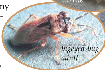
bigeyed bug adult