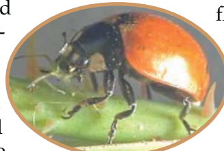
lady beetle adult

The three cornered Alfalfa Hopper, Spissistilus festinus , is a major pest in the South. It is another piercing and sucking, triangular green insect that feeds on alfalfa stems and leaves. It is also found on vegetables, soybeans, peanuts, other legumes, grasses, small grains, sunflower, tomatoes and weeds. On alfalfa, it girdles the stem during feeding, causing it to become brittle and fall over. Natural enemies include the bigeyed bug and damsel bug. The bigeyed bug has been observed causing the highest mortality (90-100%) of 1 st and 2 nd nymphal stages, while the damsel bug attacked all nymphal stages of the three cornered Alfalfa Hopper (Medal, et al., 1995).