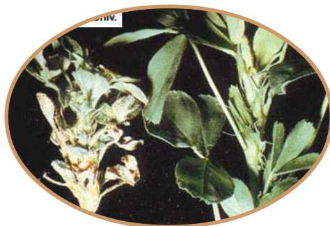
stem nematode damage

Alfalfa Stem Nematode ( Ditylenchus dipsaci ) is one of the few species of nematodes that feeds on above-ground plant parts. Alfalfa symptoms include sections of stunted plants with distorted leaves. Stem internodes are short and swollen, and some stems may turn white. These symptoms appear on spring regrowth or after the first or second cutting of an established field. Control methods include sanitation, such as cleaning equipment from infected fields before moving to other fields, and preventing runoff irriga-