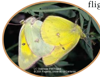
alfalfa caterpillar butterfly