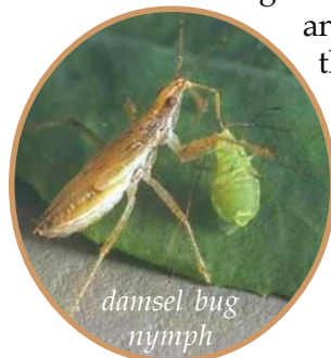
damsel bug nymph

Aphids are piercing and sucking insects from the order Hemiptera that feed on alfalfa, resulting in stunting, leaf curling or distortion, leaf drop, and yellowing of the plant. They excrete honeydew, which is a food for sooty mold fungus that contaminates alfalfa and lowers its quality. On the positive side, honeydew can serve as a food source for beneficial insects. The principal aphids that attack alfalfa are Pea aphids, Acyrtosiphon pisum ; Blue alfalfa aphids, Acyrtosiphon kondoi ; Spotted alfalfa aphids, Therioaphis maculata ; Alfalfa aphids, Macrosiphum creelii ; Clover aphid, Nearctaphis bakeri ; Cowpea aphid, Aphis craccivora ; Green peach aphid, Myzus persicae ; and the Potato aphid Macrosiphum euphorbiae . Aphids have many natural enemies that usually keep their numbers down. These include syrphid flies, aphid flies, bugs (minute pirate bugs, damsel bugs, bigeyed bugs), lady beetles, soldier beetles, lacewing larvae, insect eating fungi, and several parasitic wasps.