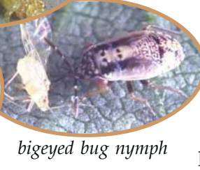
bigeyed bug nymph

Used with permission from the Department of Entomology, Ken Gray Extension Slide Collection, and IPMP3.0, Oregon State University