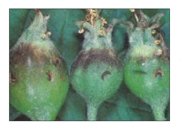
Plum trees planted as "trap trees" could serve as early detectors since the crescent signature appears earlier on the plum fruit than on the apple.

Disking during the pupal period ("cocoon stage") is a method of mechanical control effective for the following production year. The pupa of the plum curculio is very fragile. If its cocoon is disturbed, the pupa fails to transform into an adult. Pupation usually occurs within the upper inch of soil. The most desirable time to begin cultivation for destruction of pupae appears to be about three weeks after the infested fruit starts to drop from the trees. Cultivation should be continued at weekly intervals for a period of several weeks. Cultivation before the curculio