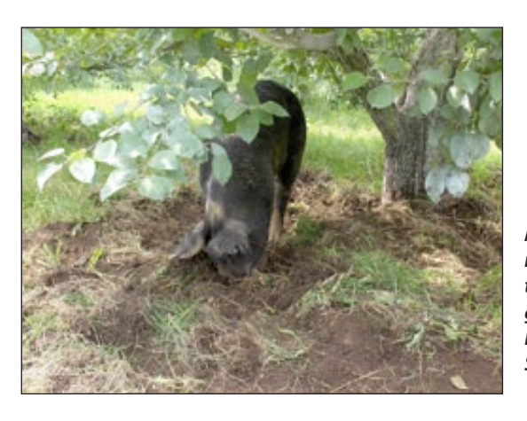
Michigan State University research is demonstrating that hogs and orchards go well together.