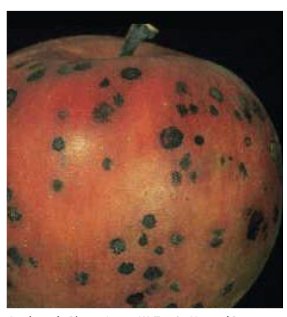
Apple scab.

Apple scab, caused by the fungus Venturia inae-qualis , is the most serious apple disease worldwide. The pathogen overwinters in dead leaves on the ground. Spores are released during spring rains, landing on and infecting leaves and fruit. Rain, duration of leaf wetness, and temperature