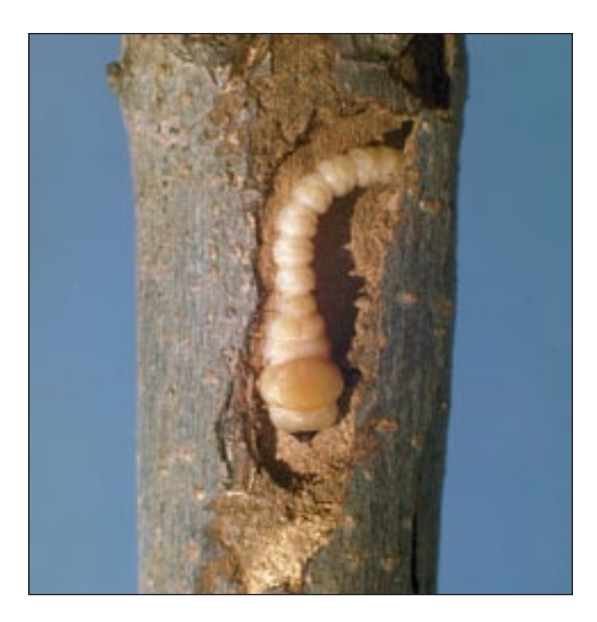
Upon hatching, the larvae burrow under the bark and feed on the cambium—the layer of tissue just underneath the bark. Development is usually completed in one year, but sometimes two years are required.

Another important production concern for organic or low-spray apple growers is borer control. There are two species of flatheaded borers that may invade apple trees. Chrysobothris femorata is the species endemic to the East. On the Pacific coast, C. mali fills a similar niche. Adults emerge from woodland trees in late April through early May and begin laying eggs beneath bark scales on the tree. The graft union is a favorite place for egg deposition.