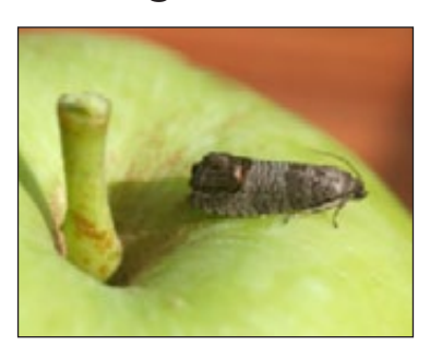
A coddling moth.