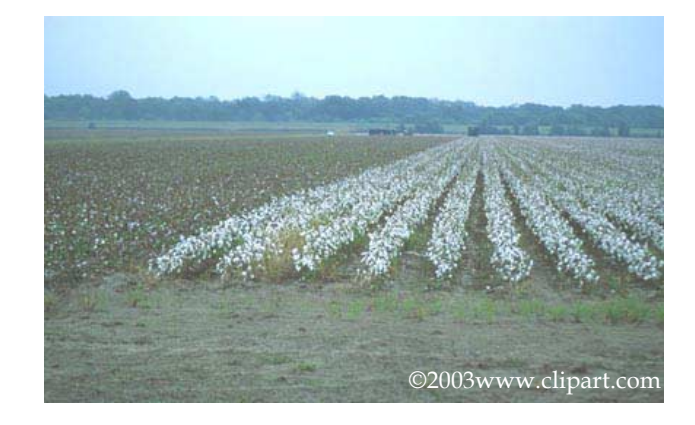
Table of Contents Introduction ...... 1 Overview of Organic Production......2 Soil Fertility ...... 2 Crop Rotation ...... 3 Cover Cropping ...... 3 Weed Management ...... 4 Insect Management Practices...... 5 Specific Insect Management Strategies ...... 10 Defoliation ...... 18 Marketing Organic Cotton ....... 19 Economics and Profitability....... 19 Summary ...... 19 References...... 20

By Martin Guerena and Preston Sullivan NCAT Agriculture Specialists July 2003