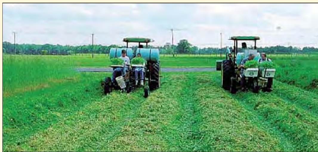
Figure 3. Transplanting tomatoes into mechanically killed hairy vetch. (From USDA Farmer's Bulletin No. 2279).

Planting cover crops known to readily winter-kill is another non-chemical means of vegetation management. Spring oats, buckwheat, and sorghum fill this need. They are fall-planted early enough to accumulate some top growth before freezing temperatures kill them. In some locations, oats will not be completely killed and some plants will regrow in the spring. Winter-killed cover crops provide a dead mulch through the winter months instead of green cover. They are used primarily in regions where precipitation is limited, such as West Texas, and in situations