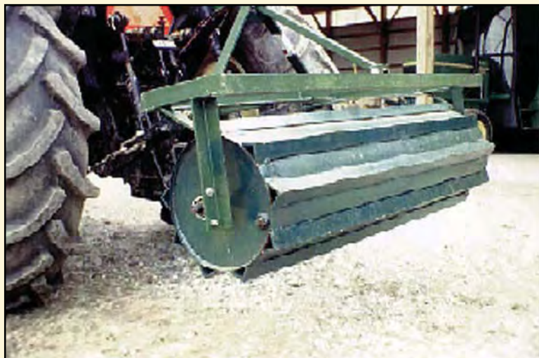
Figure 2. A homemade roller to kill cover crops (From USDA Farmer's Bulletin No. 2279).

Water consumption by green manure crops is a concern and is pronounced in areas with less than 30 inches of precipitation per year. Still, even in the fallow regions of the Great Plains and Pacific North-