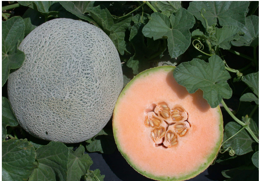
This cantaloupe cross-section shows the characteristic structure of fruit of the Cucurbits, which is three carpels within one locule.

a cantaloupe, although this is a misnomer. True cantaloupes ( Cucumis melo cantaloupen-sis ) are a rough, warty and/or sutured fruit, like Charentais melons, which are popular in Europe but only grown for the specialty market in the United States. Muskmelons include smooth-skinned varieties such as honeydew, Crenshaw, and Casaba, as well as netted-rind fruits such as Persian melon and Santa Claus or Christmas melon. These inodorus variants