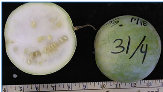
This particular egusi melon resembles a small watermelon. These melons are beaten or cut into halves, then piled up, covered in the field, and left to deteriorate for a few days to aid in extracting the edible seeds. These seeds are then washed, dried, and later peeled, thus readying them for cooking.