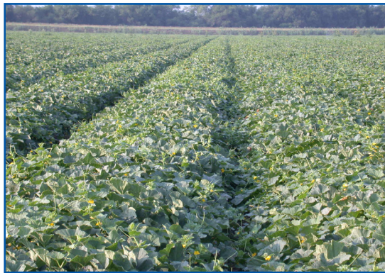
Melon field in full flower. Melons require adequate pollination to ensure good fruit set: one honeybee hive per acre is the suggested stocking rate.

Because melons prefer a long, hot growing season, use plastic or biodegradable paper mulch and row covers in northern areas for earlier crops and better yields. Remove covers when plants have female flowers (tiny fruit at base of blossom). Paper mulch deteriorates too fast in the humid South to be very useful.