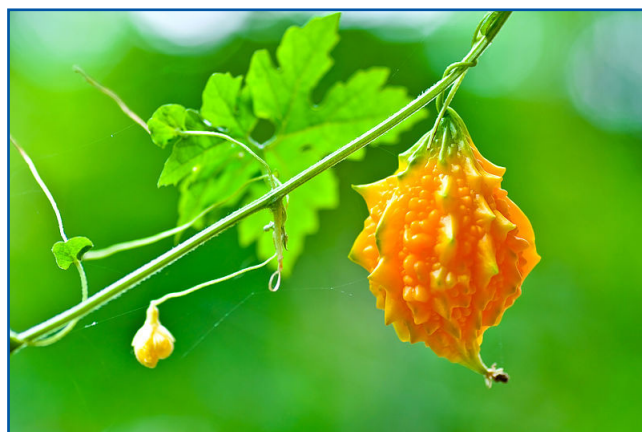
Momordica , or Bittermelon, is an alternative crop for growers wishing to diversify their vegetable operations. Only the red arils surrounding the seeds of the ripened fruit are sweet. The rest of the plant is, as its name implies, very bitter.

Melons belong to the cucurbit family (Cucurbitaceae), which also includes cucumbers and squash. Although melons have been found in ancient China, Egypt, and Iran, their center of diversity is Africa, with secondary centers in China and India. Wild melons have been reported in desert and savanna zones of Africa, the Arabian Peninsula, southwestern Asia, and Australia (Kirkbride,