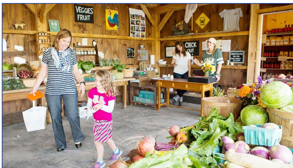
Farmers Market at Willowsford Farms.