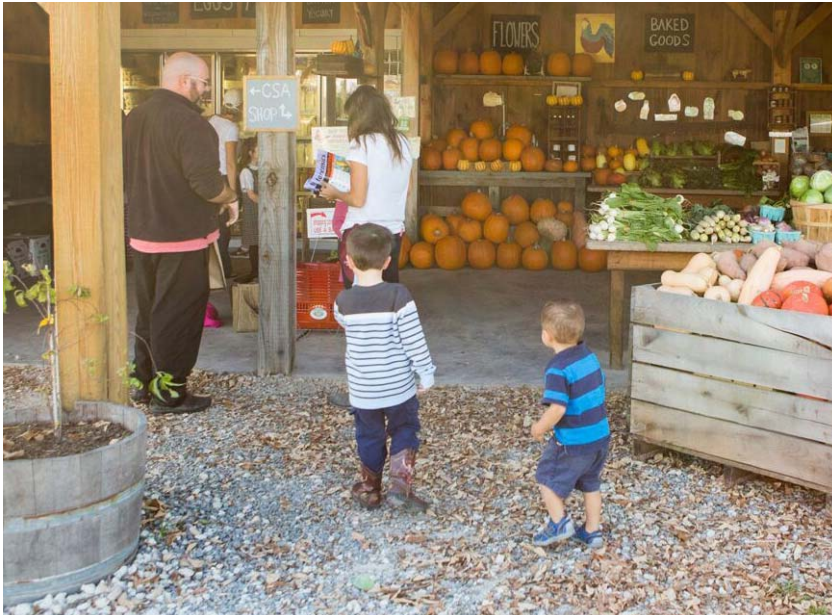
Agrihood farmers markets help encourage healthy lifestyles.

While a traditional rural development often has only one home for every 10 or even 20 acres, an agrihood typically has a much denser housing component, which can keep a much larger portion of land in agriculture or green space than an unplanned subdivision might use. And new agricultural preservation policies at the city and county level are becoming increasingly common across the United States. These new zoning approaches can help direct developers to preserve open land and farm operations in agrihoods.