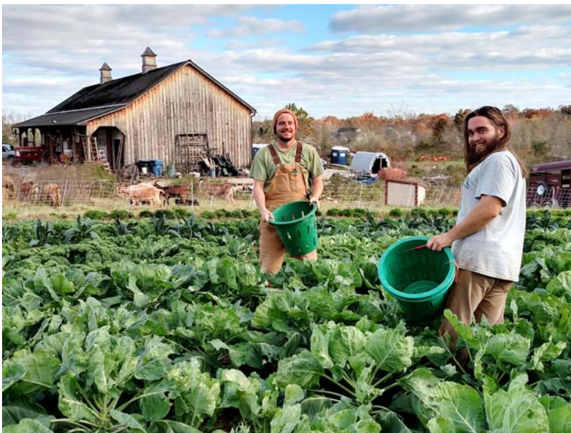
Farmers harvesting vegetables at Willowsford Farm.