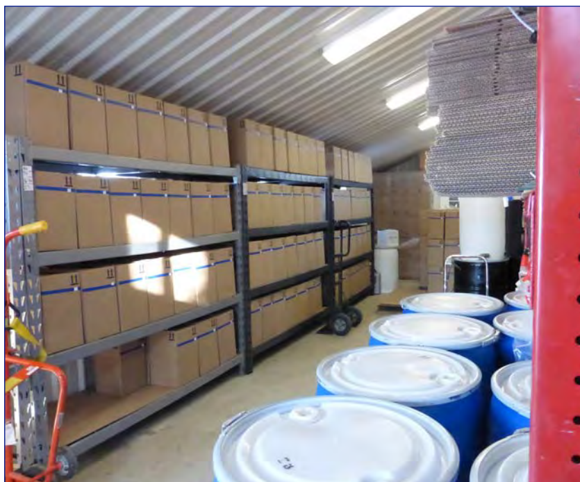
These safflower oil containers are stored in a cool, dry, north-facing building to maximize the oil's shelf life.

Seed meal is a valuable by-product of pressing oilseeds. Sesame seed cake is valuable as a human food. Sunflower seed cake is not suitable for people, but it makes a good addition to chicken, pig,