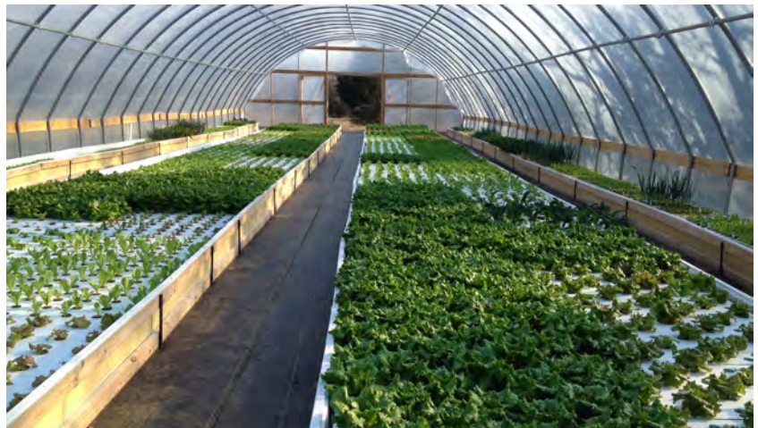
Floating raft. Adapted from Burden and Pattillo, 2018.