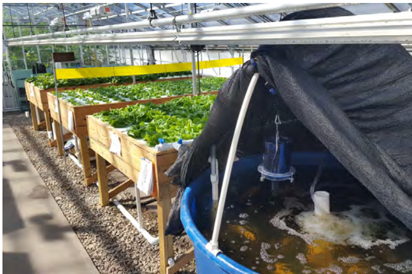
Aquaponic system.

A small-scale aquaponic system can augment a home garden and provide a healthy source of food. If a production-scale operation is not what you’re looking for, but you envision a small project for your homestead, backyard, or small farm, see Principles of Small-Scale Aquaponics from the Southern Regional Aquaculture Center, at https://srac-aquaponics.tamu.edu/viewFactSheets .