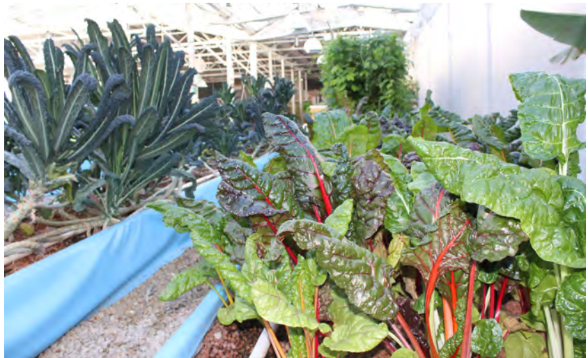
Flood and drain.