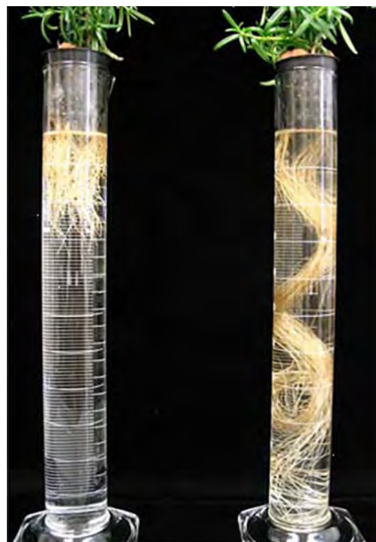
Rosemary roots grown hydroponically (left) and aquaponically (right).