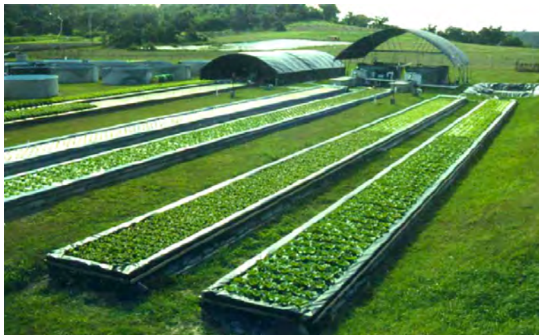
UVI aquaponic system.

The system components are as follows: four fish-rearing tanks at 2,060 gallons each, clarifiers, filter and degassing tanks, air diffusers, sump, base addition tank, pipes and pumps, and six hydroponic troughs totaling 2,303 square feet (Aquaponic Doctors, no date). The pH is monitored daily and maintained at 7.0 to 7.5 by alternately adding calcium hydroxide and potassium hydroxide to the base addition tank, which buffers the aquatic system and supplements calcium and potassium ions at the same time. The only other supplemental nutrient required is iron, which is added in a chelated form once every three weeks.