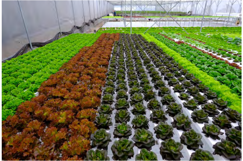
Nutrient film technique.