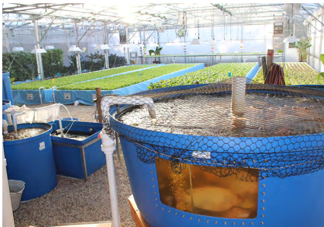
Aquaponic system.

Aquaponics is a bio-integrated system that links recirculating aquaculture with hydroponic vegetable, flower, and/or herb production. Advances by researchers and growers alike have turned aquaponics into a working model of sustainable food production. This publication introduces aquaponic systems, discusses economics and getting started, and includes an extensive list of resources that point the reader to print and online educational materials for further technical assistance.