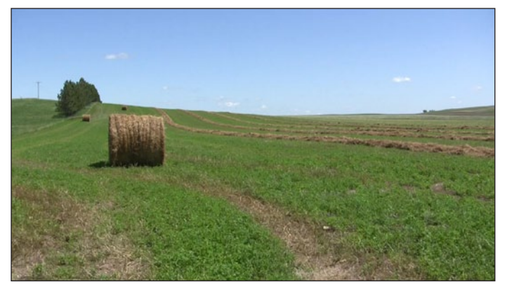
The Boehms' hay field.

While the cattle are not certified organic, they are managed under conditions that allow them to be marketed as "Natural" or "Grass Fed." They can also sell under the Certified Angus label, since the cattle are a cross between Angus and Black Simmental. Feeder cattle and culled cows are sold at the auction yard in Dickinson at an average weight of 1,200 pounds. Bred cattle are sold directly to other livestock producers.