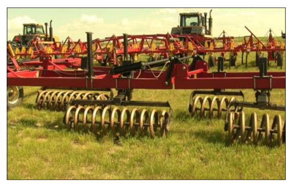
Toolbar with coilpackers.

portion has a noticeable amount. While tansy mustard and lambsquarter are common weeds on Randy's farm, they don't really concern him because they can be controlled well with tillage.