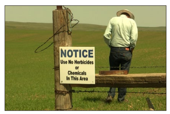
Field of organic spring wheat, Hinebauch Farm.