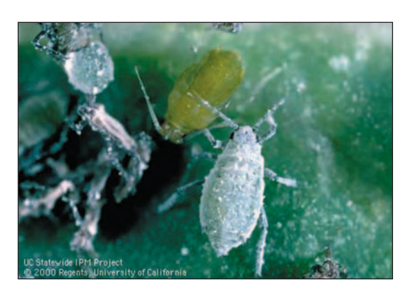
Cabbage aphid.

The cabbage aphid, Brevicoryne brassicae , is a major pest of cole crops worldwide. It is small (1/8 inch long), dark green, and exudes