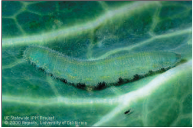
Imported cabbageworm.