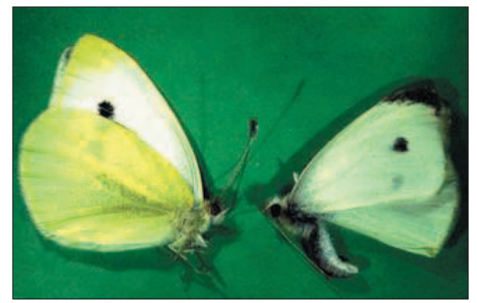
Imported cabbageworm moths.