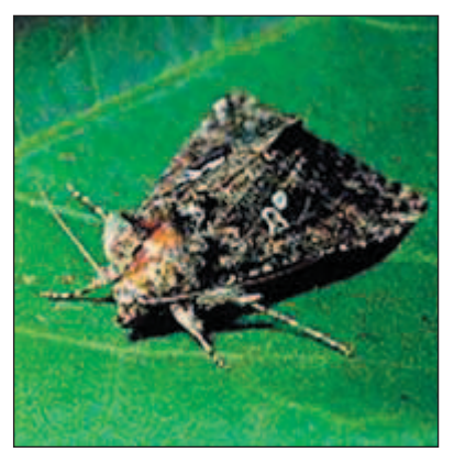
Cabbage looper moth.