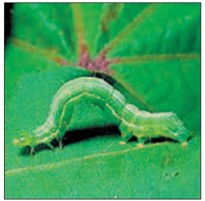
Cabbage looper.