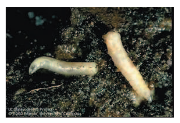
Cabbage maggot.

Compost and straw mulches significantly reduce the population of root maggots infesting broccoli. The mulch acts as a barrier, preventing the flies from laying eggs directly in the soil. It also serves as a habitat for ground beetle and rove beetle that parasitize and