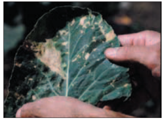
Downy mildew.

to the sporulating areas on the undersurfaces of the leaves. Infected young seedlings may die, while cauliflower curd, broccoli florets, radish roots, and cabbage heads may all become unmarketable. Management includes promoting good drainage, increasing spacing for better aeration, controlling brassica-type weeds, using resistant varieties, rotating with non-cole crops, incorporating plant debris, and avoiding the use of overhead irrigation.