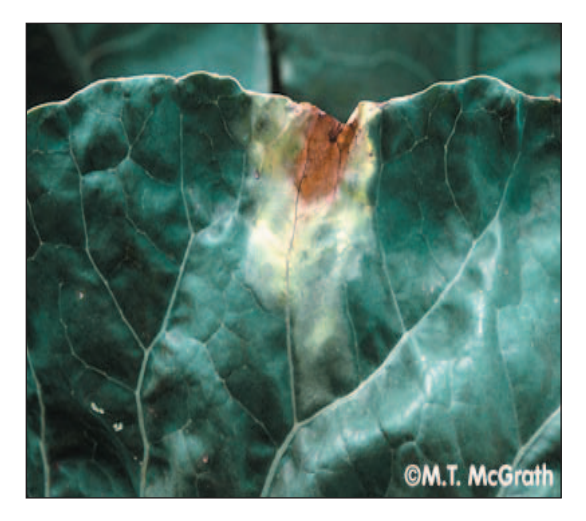
Black rot.

Black rot is caused by the bacterium Xan-thomonas campestris . This bacterium favors humid, rainy conditions, and is dispersed by the splashing of droplets of water. Xan-thomonas enters the plant at leaf margins or through wounds. Leaf margins develop yellowish patches that turn brown with black veins. The infection works its way down the leaves, leaving a "V" pattern in its wake. The