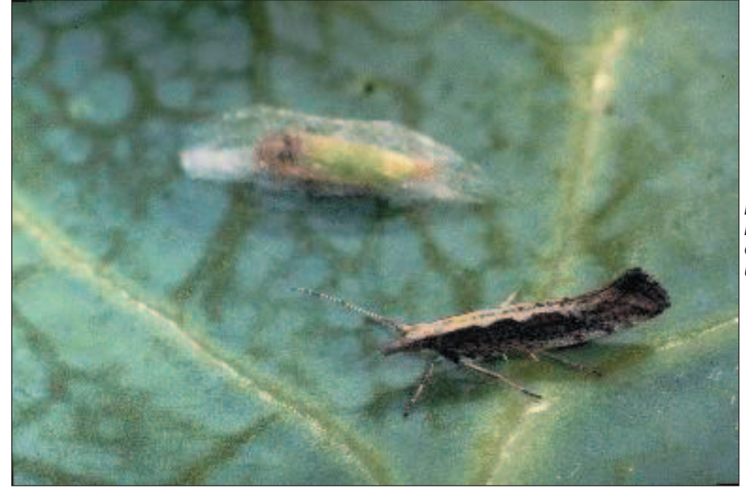
Diamondback pupae and adult.