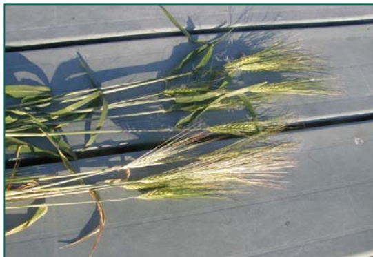
Barley from South Field (top) and North Field (bottom).

make way for an early August planting of a cover crop cocktail on both fields. The moisture content of the grain was about 20%, so he finished the drying with a bin drying system. He did end up blending the barley from the North Field and the South Field so that the entire crop would meet the malt barley contract specifications. Without the blending, the North Field barley would not have met the specifications.