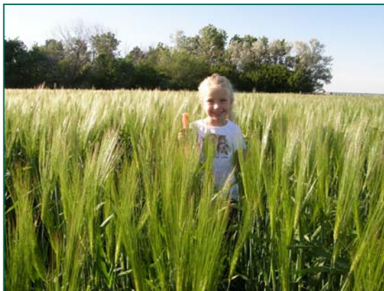
Barley from South Field 2008.