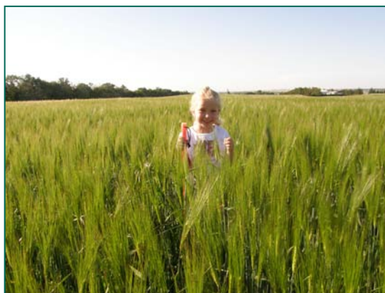
Barley from North Field 2008.

No-Till Case Study, Brown's Ranch: Improving Soil Health Improves the Bottom Line