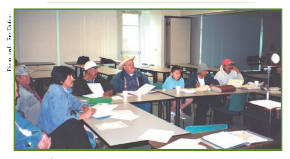
Monthly safety meetings reduce accidents and workers' compensation costs.

- Female employee, Central Valley, California