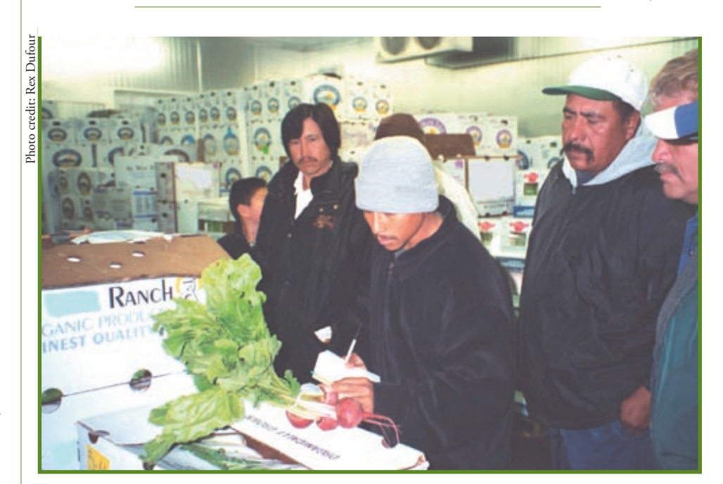
Employees can teach each other how the business works. In the process, everyone learns leadership, responsibility and cooperation.