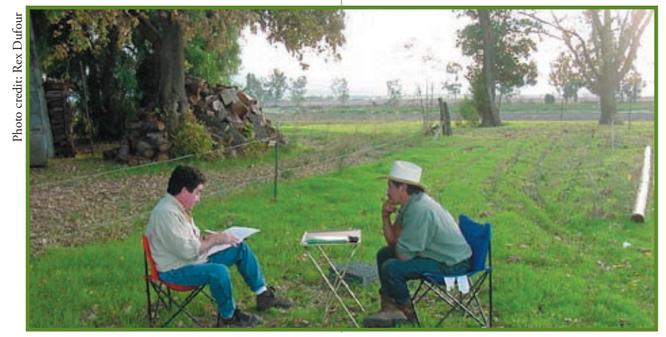
Interviews are important in order to understand the experience and knowledge base of prospective employees. Performance tests are another way to ensure that employees have the skills you're looking for.