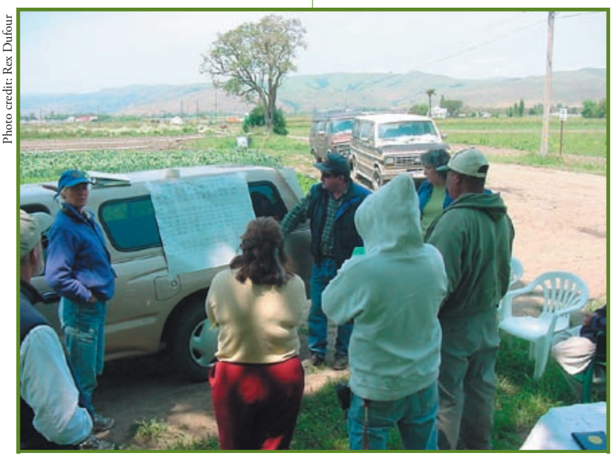
Regular staff meetings with employees provide a place to discuss production tasks, personnel conflicts, and safety concerns.