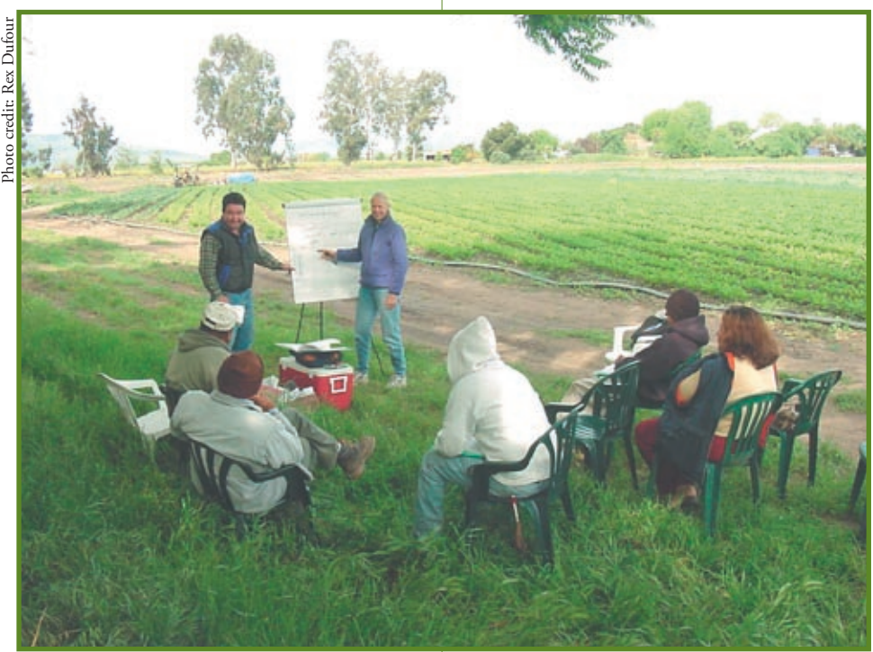
On-farm educational sessions can help employees understand how businesses operate or they can address some other common interest.

National Association of State Directors of Migrant Education: www.nasdme.org/index.html National Migrant and Seasonal Head Start Association: www.nmshsa.org