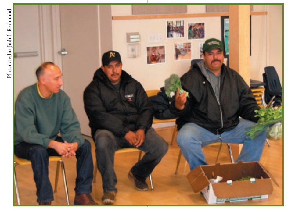
Drivers from a Yolo County farm visit a school in Oakland to talk about the farm's Community Supported Agriculture program. The classroom teacher is on the left.