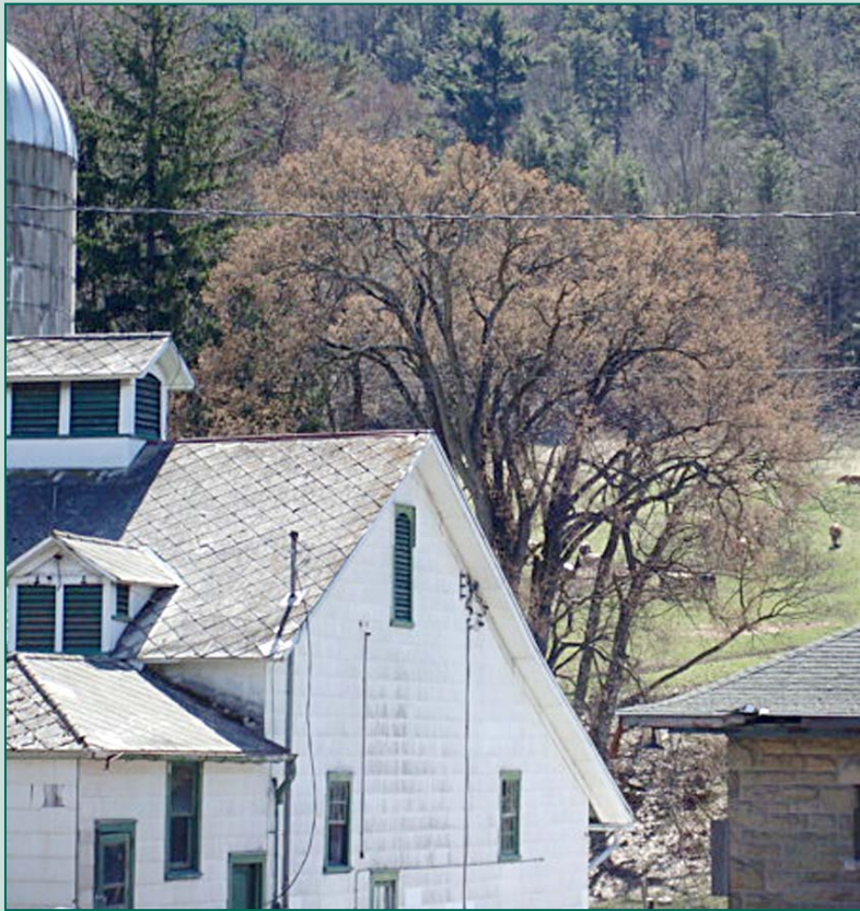
The Lands at Hillside Farms, Shavertown, Penn.