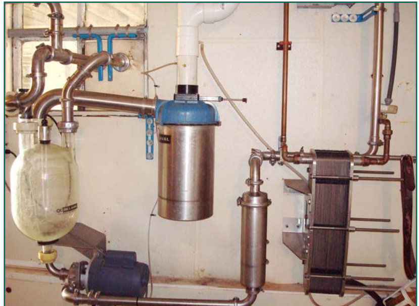
A well water precooler (far right) cuts compressor use by using groundwater to pre-cool the milk.

There are two types of RHR units: desuperheating and fully condensing units. A desuperheating unit operates only when the refrigeration system operates and produces water temperatures around 95 to 115 degrees (Ludington et al., 2004). These units can be inexpensive to add, but only part of the available heat can be transferred to the water. Nearly all of the available refrigeration heat is recovered as hot water from a fully condensing unit, with temperatures reaching 120 to 140 degrees (Ludington et al., 2004). This type of RHR unit meets the requirements of the cooling system by using a valve to control the flow of cold water through the heat exchanger. Once the storage tank is full, excess warm water can continue to be used and not wasted. A fully condensing RHR unit replaces the need for a regular condenser in the refrigeration system and is best integrated as part of a new or replacement refrigeration system. If nearly all of the energy captured by the RHR unit is used for preheating water, then a precooler is not