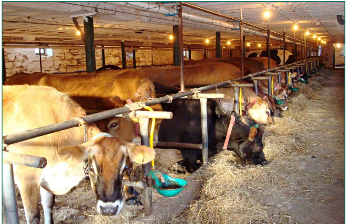
Dairy farms use vast amounts of energy to harvest milk.