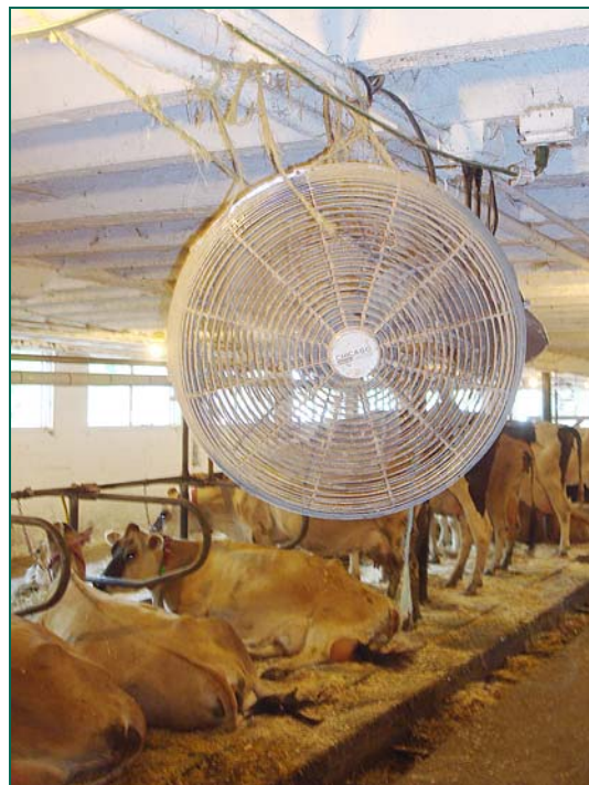
Circulation fans help improve air movement inside a barn.

There are two types of ventilation: natural and mechanical. Natural ventilation uses the least amount of energy and requires the exchange of air, the ability to control ventilation rates, flexibility to provide the cows a comfortable environment throughout the year and good barn construction (Wood Gay, 2002). Barns that are in the path of prevailing winds and designed with