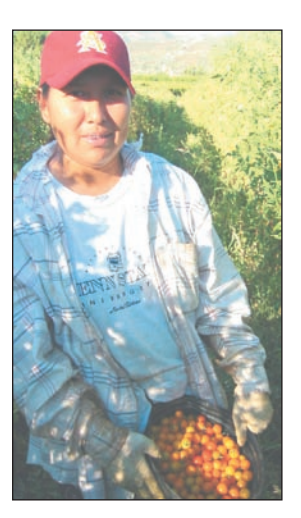
Produced by California Institute for Rural Studies (CIRS) & National Center for Appropriate Technology (NCAT) © 2010 CIRS RME-D7402565