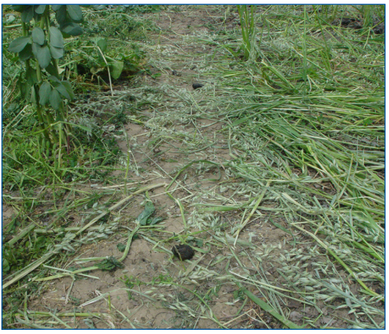
Sheep manure in a cover cropped walnut alley. This farmer stopped grazing sheep in their walnut orchard due to the potential risk (and liability) of contamination by pathogens from undecomposed manure contacting walnuts during harvest.

• Organic producers making their own compost must keep accurate records of their composting operations to demonstrate that the compost was produced according to the criteria cited above.