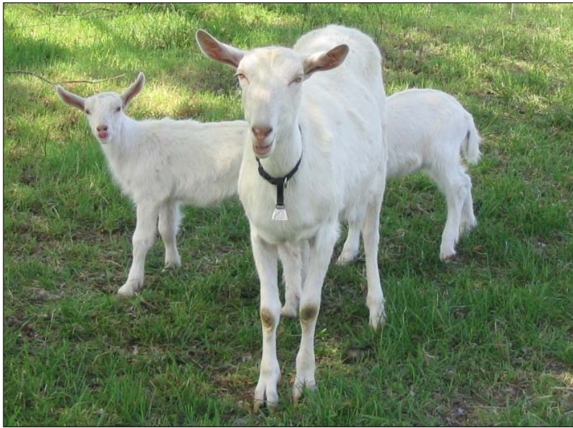
This young doe is still growing and is feeding twins. She is at risk for increased parasite infection because of these stresses.

100 g of cottonseed meal (31% crude protein) per head, per day, but were fed just twice weekly, at 350 g per feeding, to lower labor cost. The supplemented lambs had 44% higher gains than lambs without supplement, and 35% lower FEC (Eady et al., 2003). In Missouri, young lambs that were fed \frac{1}{4} pound of soybean meal per day had higher gains and higher hematocrits (showing less anemia, expressing greater resistance to H. contortus ) (Ross, 1989). Some experimentation will be necessary in your situation. In addition to protein, consider minerals, especially copper and zinc, which are associated with the immune system (Sykes and Coop, 2001). Also, when energy is limiting, an energy supplement is helpful (Valderabano et al., 2002; Hoste et al., 2005). Supplementation of protein and energy can be provided through better-quality pasture, and this may be more economical than purchased supplements. Planting more legumes on the farm will improve soil and will improve the nutrition available to the animals. See ATTRA's Ruminant Nutrition for Graziers for more information and consult your local Cooperative Extension Service to learn about legumes and other forages that may do well in your area.