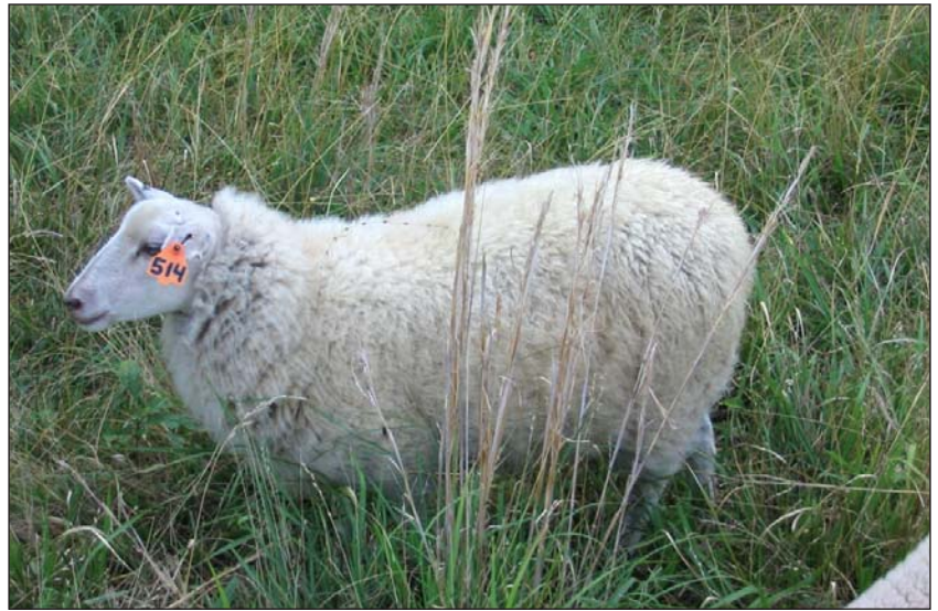
Resistant animals, such as this Gulf Coast ewe, suffer less parasitism and shed fewer parasite eggs. Selecting resistant animals is the best long-term strategy for improving animal health.

Young animals have no immunity to internal parasites. This immunity develops slowly and only with exposure to internal parasites. Lambs acquire immunity at four to nine months of age, depending on the species of parasite and on exposure levels (Younie et al., 2004) and breed of sheep. This acquired immunity was seen in a study where lambs were infected with parasites, with peak egg counts seen when lambs were 11 weeks old. Six weeks later those counts had dropped three-fold, showing that lambs were expressing resistance (Athanasiadou et al., 2006). Ewes and lambs had a sudden drop in fecal egg count in August in Spain after showing signs of clinical disease (Uriarte et al., 2003). Organically raised lambs on another study were lagging behind conventionally raised lambs in their first year. The following year the trend was reversed, with the organic yearlings expressing resistance and gaining better than the conventional yearlings that were treated with anthelmintics (Niezen et al., 1996). These studies all demonstrate that animals have the ability to respond to internal parasite infection after exposure.