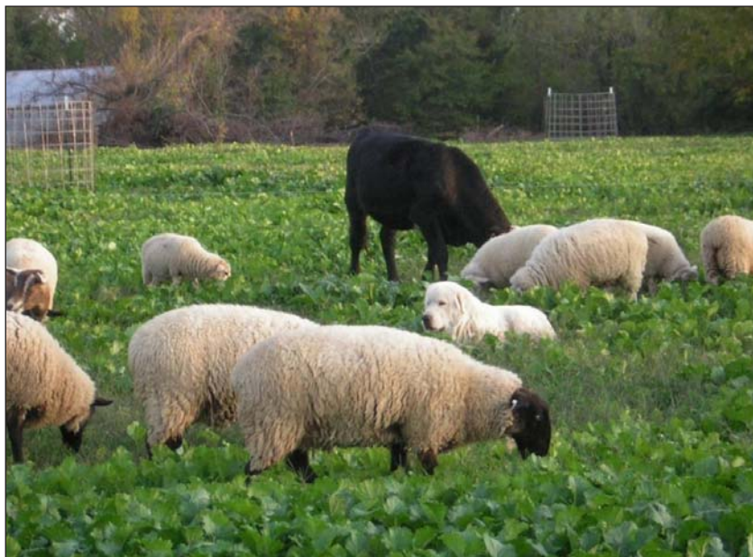
Grazing turnips in the fall provides sheep and goats with “clean” grazing and excellent nutrition during breeding season.

Maintaining adequate forage height is important for avoiding parasite infection and providing good