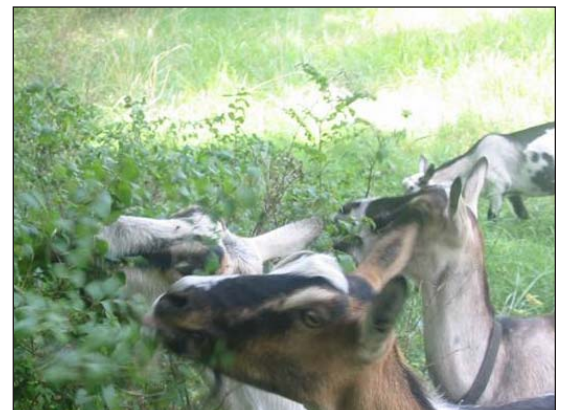
Goats browsing.