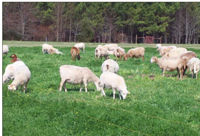
Rotational grazing sheep.

A summary of SARE-funded work done by the ACSRPC is collected in this article: www.sare.org/Learning-Center/Fact-Sheets/National-SARE-Fact-Sheets/Sustainable-Control-of-Internal-Parasites-in-Small-Ruminant-Production