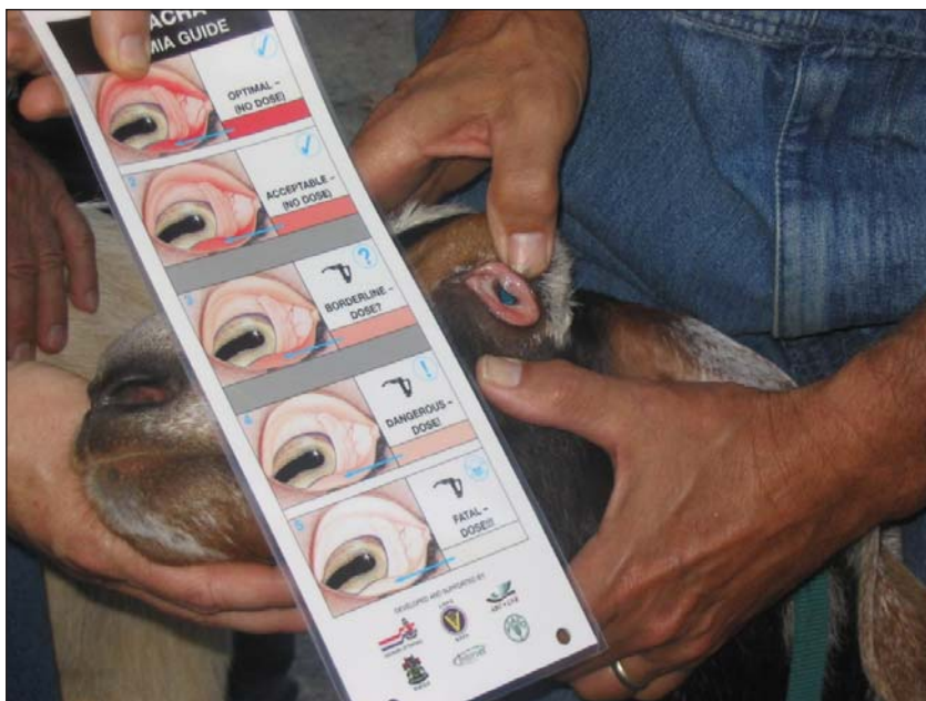
Use FAMACHA® to assess levels of anemia.