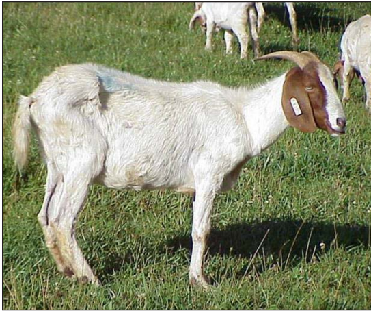
This goat shows signs of severe parasite infection.

a “reservoir” that will protect the larvae from weather extremes (Leathwick et al., 2011). Several researchers have studied the vertical migration (how high on the grass blade the larvae are found) and the results are discouraging; larvae may be found at the top of the grass blades, more than 20 cm high (about eight inches) (Amaradosa et al., 2010; Gazda et al., 2009; Santos et al., 2012; Silva et al., 2008). However, most of the larvae are usually found near the base of the plant, especially during dry periods.