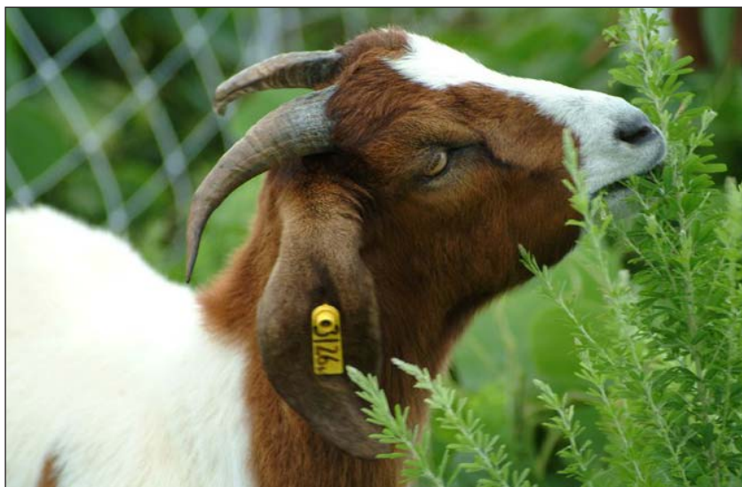
Sericea lespedeza is readily consumed by goats and sheep and will help control internal parasites.

Tools to help integrate the multiple management concepts listed above are being created. These decision trees may be available online in the future and will allow producers to get the help of computers in sorting through the complexities of pasture, animal, and parasite interactions. In the meantime, managers have to develop the habit