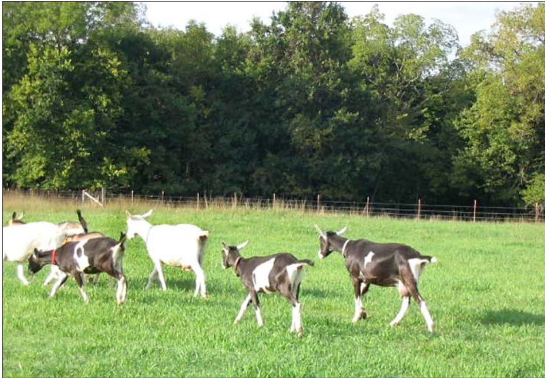
Good pasture management and attention to nutrition help raise healthy small ruminants.