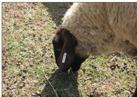
This sheep is getting no nourishment but plenty of parasites in this situation.

If your pastures always seem “too short” and you aren’t able to give them enough rest time