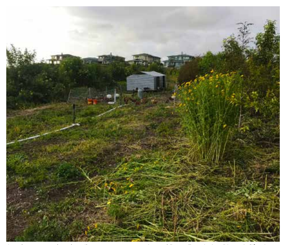
An urban pastured poultry silvopasture system at Coastal Roots Farm in San Diego, California.

Urban agroforestry systems can be great spaces for engaging and educating the community, if that is one of your goals. Some ideas for engaging the community include hosting volunteer days, workshops, festivals, and other events, as well as inviting schools to use the space as an outdoor classroom. Other options include installing educational signage, opening the space for free foraging, offering benches so that people can use the space to connect with nature, and more.