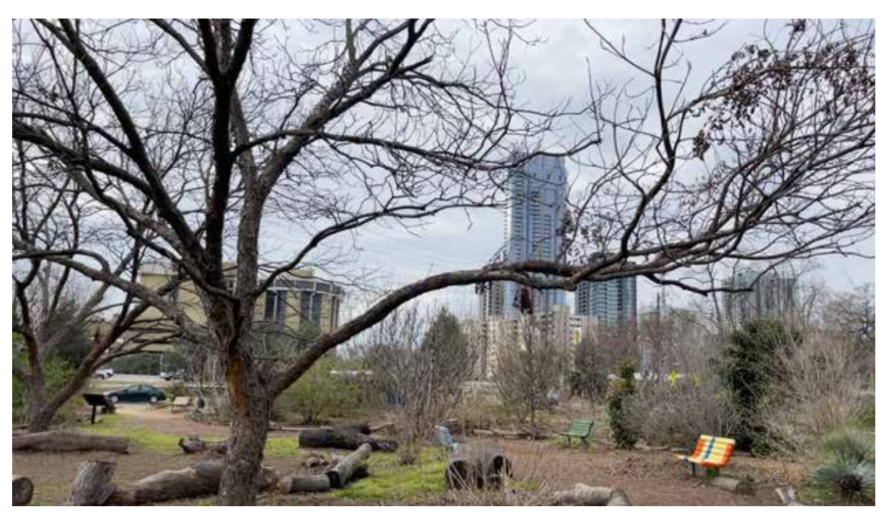
The Festival Beach Food Forest in Austin, Texas - a food forest on public park land.

Layout and spacing are other important design considerations, in order to avoid competition between plants while satisfying your goals and maximizing production. If you are planting a food forest with multiple vertical layers of plants, be sure to space overstory trees, understory trees, and shrubs at sufficient distances from one another, in order to avoid niche overlap. Understory plants such as vines, annual plants, and root crops can occupy space under tree canopies, but they should be planted several feet away from tree trunks in order to avoid competition with tree roots. Sprawling groundcover plants with shallow roots may be planted close to other plants without causing excessive competition. If you are implementing another type of agroforestry practice in an urban space, be sure to follow design guidelines for those specific practices, while also taking into account the specific growing conditions of your site and the surrounding urban environment.