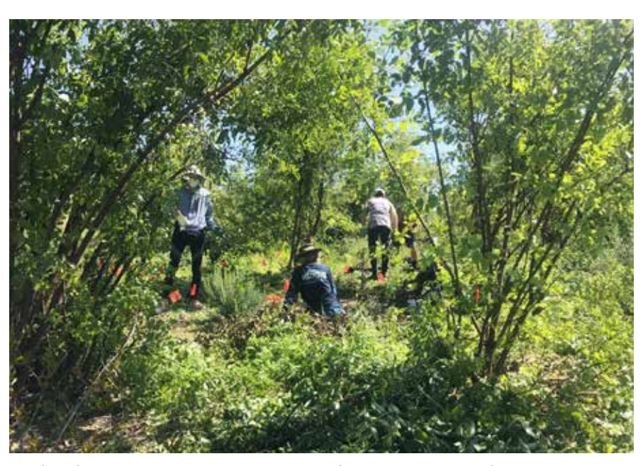
The food forest at Coastal Roots Farm, an urban farm in San Diego, California.

Food forests consist of multiple vertical layers of woody and nonwoody vegetation that mimic the multiple layers of forest ecosystems. Most plants in food forests are either edible, medicinal, or ornamental and are planted to satisfy human needs, but plants that provide food and habitat to wildlife can also be utilized. Typically,