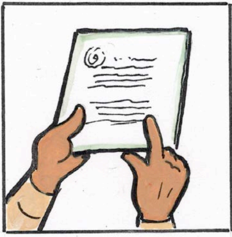
Muaj tus OIN, operator identification number