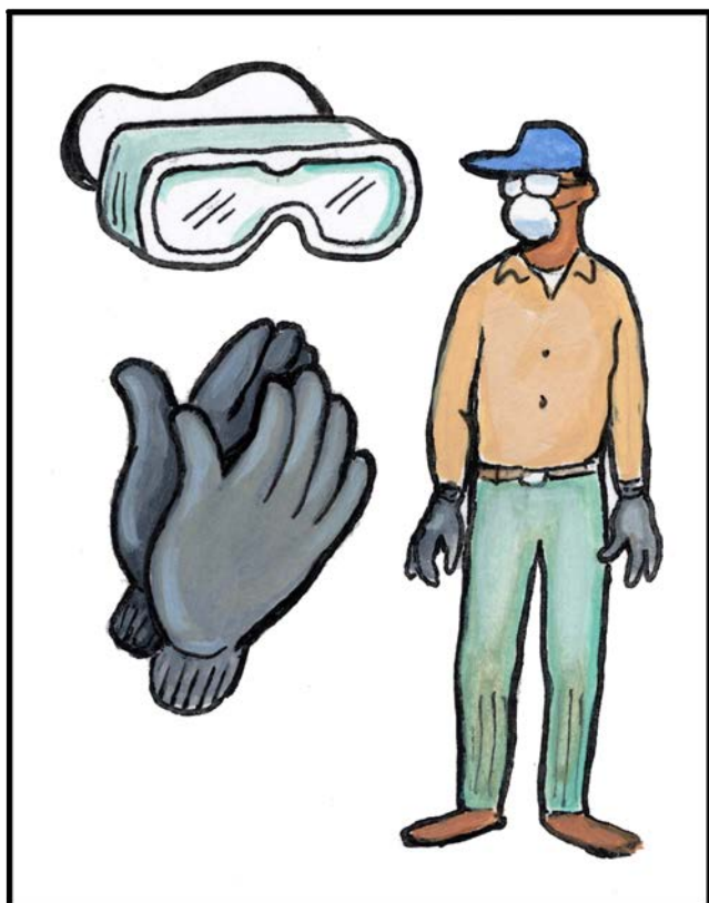
Looj tej khoom siv tiv thaiv raws kev cais (PPE)

Txhua zaus koj yuav tshuaj ces yuav tsum nyeem daim qauv tshuaj. Txawm tias koj twb tau siv duas los lawm, xyuas seb yuav siv tshuaj ntau npaum cas. Yuav tsum nkag siab thiab ua raws li tej lus ceeb toom uas sau nyob hauv daim qauv tshuaj