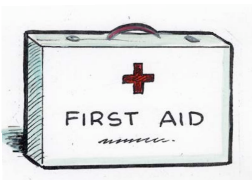
Nkag siab thiab paub txog cov ntaub ntawv First Aid

Muab sau cia hauv ntaub ntawv tias siv ntau npaum cas lawm