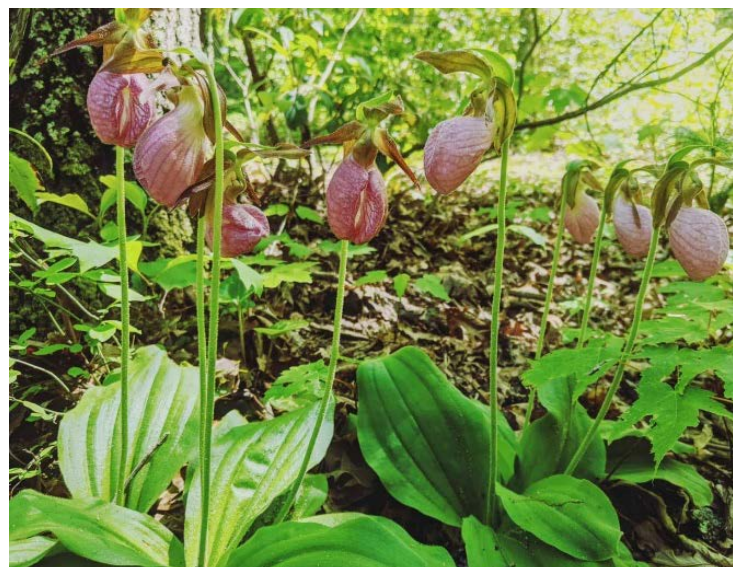
Native Lady Slippers.

Invasive species pose a significant threat to Appalachian ecosystems. Strategies for invasive species control include early detection and monitoring, mechanical removal, biological control, restoration of native vegetation, public education, following policy, and regulation enforcement. Curbing the spread of invasives helps protect the integrity of habitats and ensures the survival of native plants and animals.