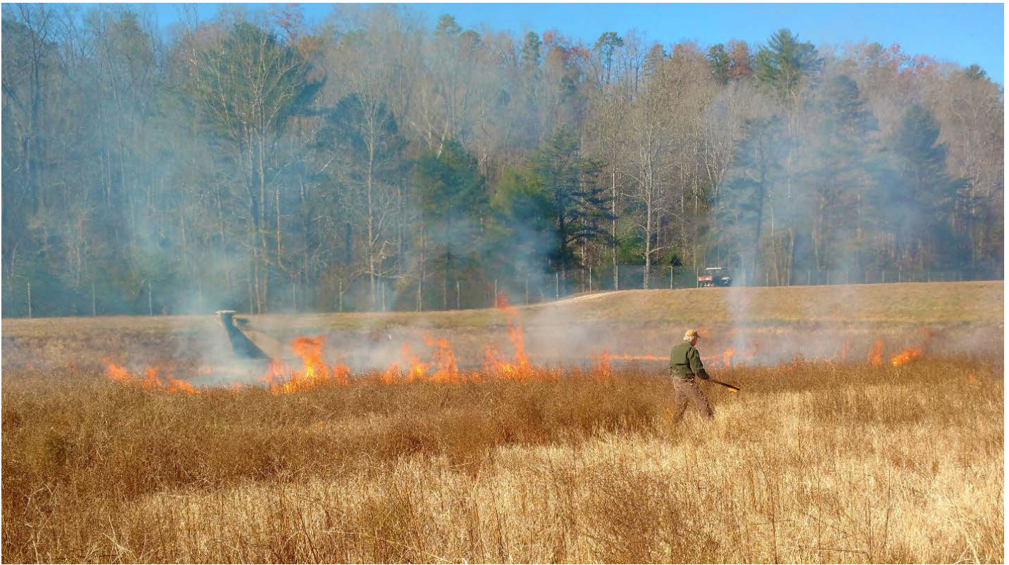
Prescribed burn.