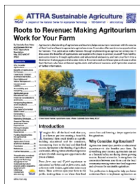
Roots to Revenue: Making Agritourism Work for Your Farm (new)