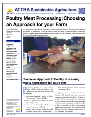
Poultry Meat Processing: Choosing an Approach for Your Farm (new)