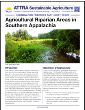
Agricultural Riparian Areas in Southern Appalachia (new)