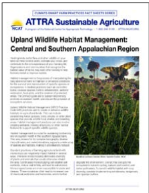
Upland Wildlife Habitat Management: Central and Southern Appalachian Region (new)