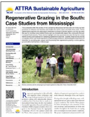
Regenerative Grazing in the South: Case Studies from Mississippi (new)