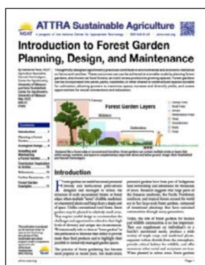
Introduction to Forest Garden Planning, Design, and Maintenance (new)