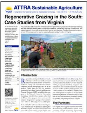
Regenerative Grazing in the South: Case Studies from Virginia (new)