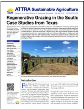
Regenerative Grazing in the South: Case Studies from Texas (new)

"Following ATTRA guides have been like a cheat code to production success. I just need to follow what an ATTRA specialist wrote, and if I do the work, I reap the rewards." —Commercial producer, New York