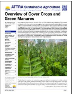
Overview of Cover Crops and Green Manure (new)