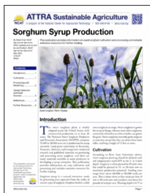
Sorghum Syrup Production (update)