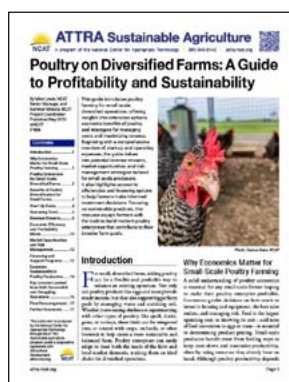
Poultry on Diversified Farms: A Guide to Profitability and Sustainability (new)