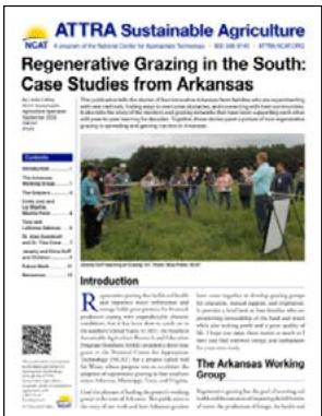
Regenerative Grazing in the South: Case Studies from Arkansas (new)