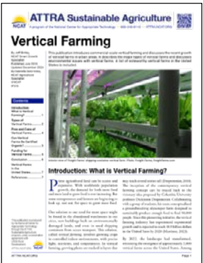
Vertical Farming (update)