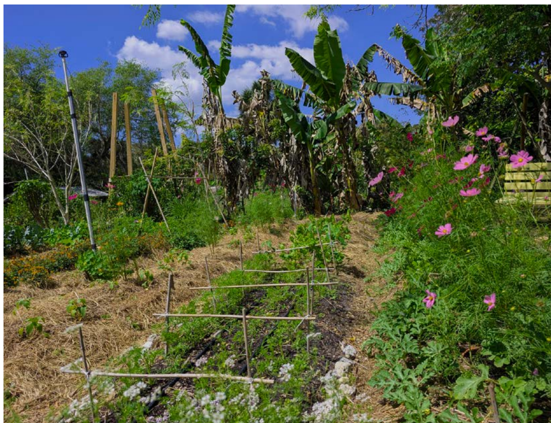
Organic garden at ECHO Global Farm in North Fort Myers, Florida.

This publication is produced by NCAT through the ATTRA Sustainable Agriculture program, under a cooperative agreement with USDA Rural Development.