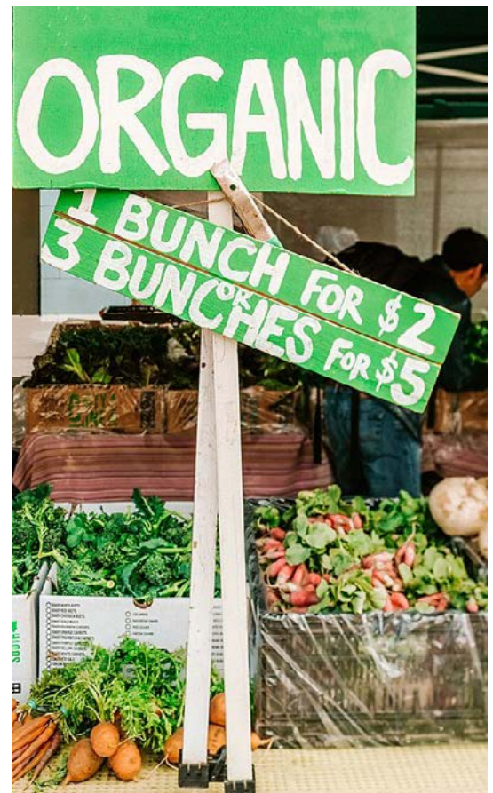
Organic vegetables on display at a farmers market.

Before making the shift to organic production, it's important to take a close look at your farm's current condition and long-term goals. Every operation is different, and the path to certification varies depending on your land use history, infrastructure, and management systems. Thoughtful planning at this early stage can save you time, money, and frustration later.