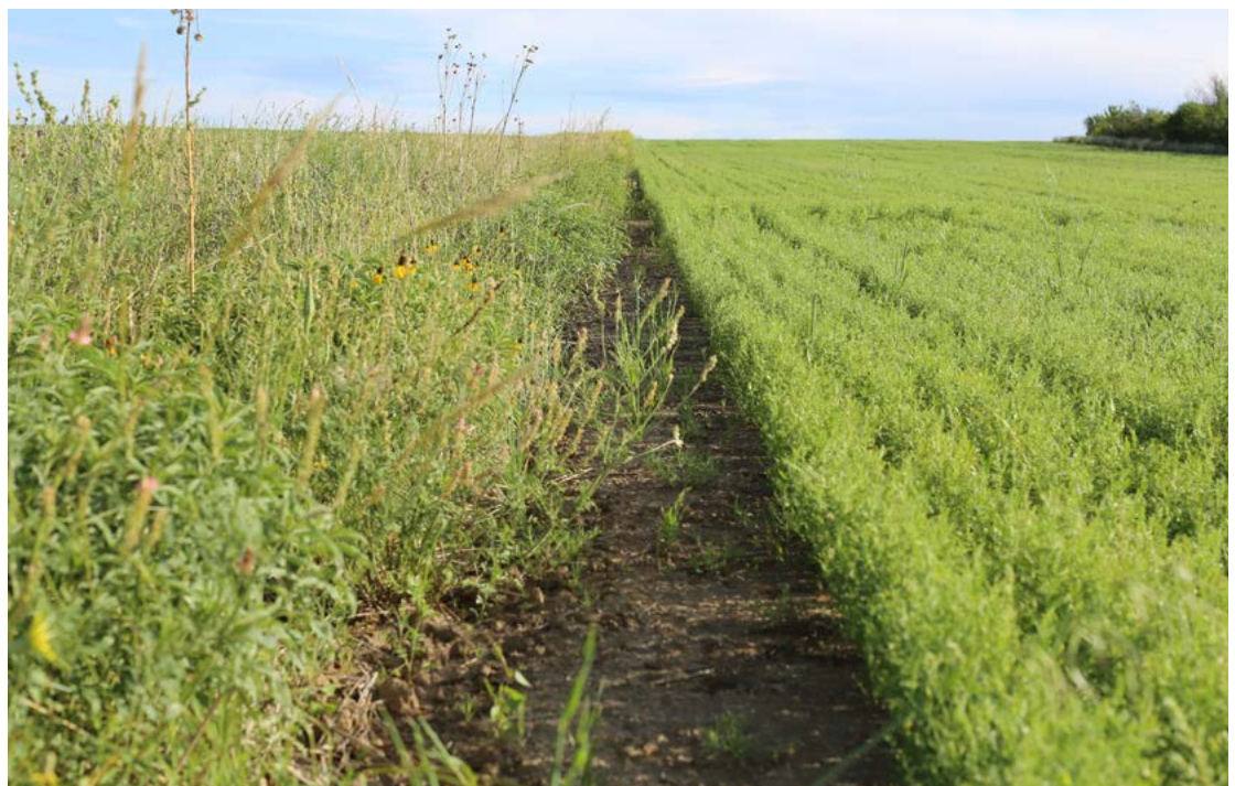
Riparian buffer.